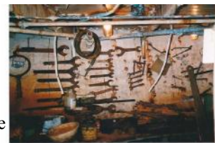
Engine room LV76 Spring 2005