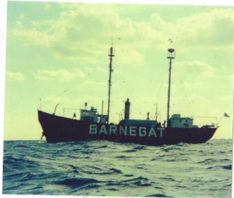
BARNAGAT LV79/WAL 506