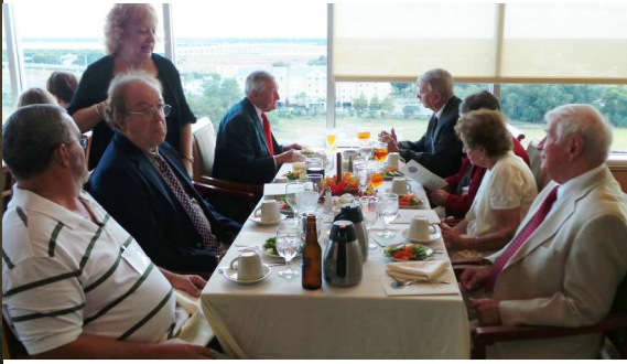
One of the 10 tables