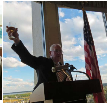
A toast to all that served