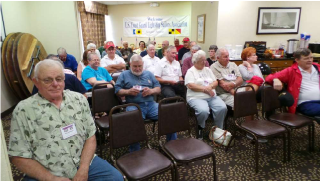
Some Members at General Membership Meeting