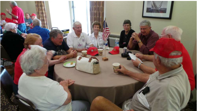
Having just received the vouchers for the free three hotel nights to be sold as a raffle to a lucky winner at the banquet.

Our apologies to our Ladies Auxilliary, The Mermaids, for not having a picture of the spread during both our hospitality time as well as our Lightship Sailors Social.