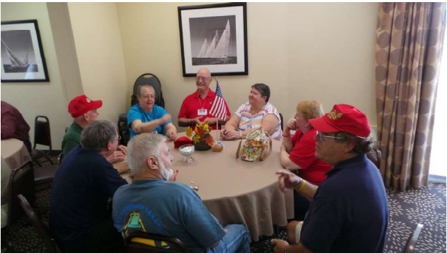
Social Time in Hospitality Suite