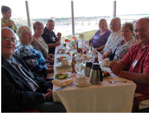
Fred Pelger and Company