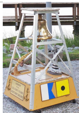
WAL 189 BELL