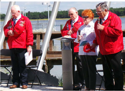
ANNUAL MEMORIAL SERVICE