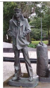
"THE LONE SAILOR"