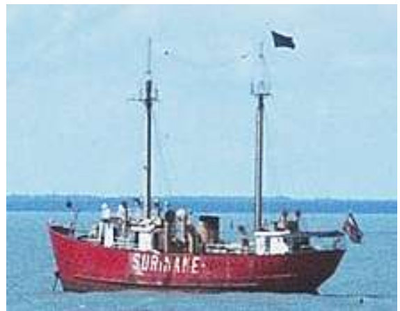
LV-106/WAL-528 as Lightship Suriname River 2 Color Photo source; Lightphotos.net, World of Lighthouses