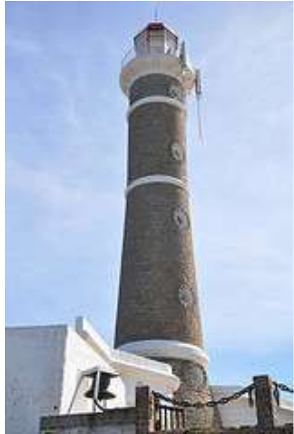
Faro (Lighthouse) Jose Ignacio with LS-111 Fog Signal Bell displayed at its base.

Faro Jose Ignacio, Punta del Este, Uruguay; photos courtesy of Willysancarlos