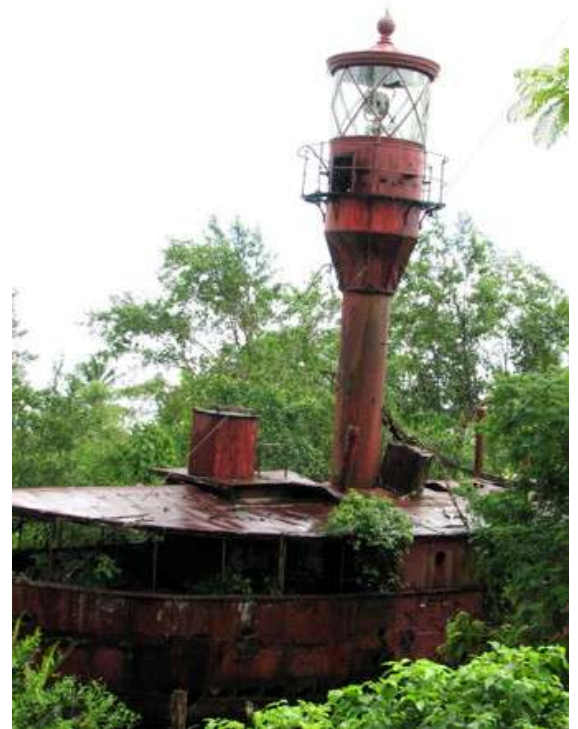
aka; Lightship Suriname - 1 Courtesy of Nicholas Picasa April 2009 photo