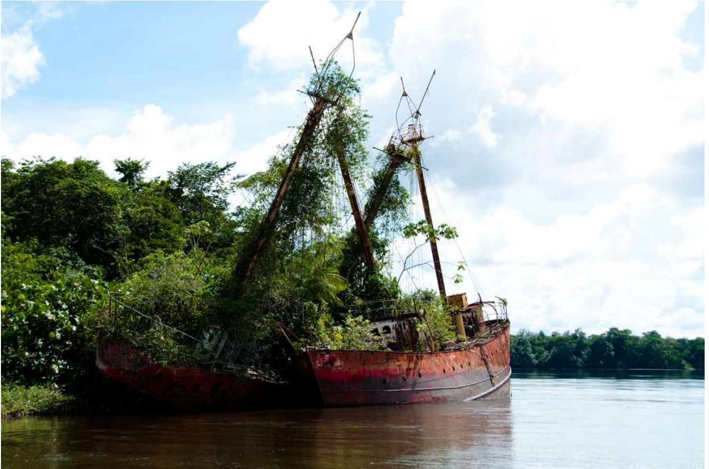
LV-109 (former Lightship SURINAME 3) on left, LV-106 (former Lightship SURINAME 2) on right

Different view and close up taken at low tide with much of the hulls exposed.