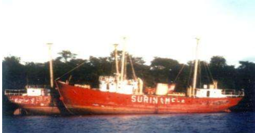
The ex-LV-106 foreground & the ex-LV-109 background shortly after they were abandoned along the banks of the Suriname River, 1981?