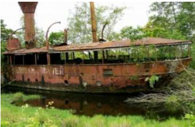
SURINAME - 1, with brush cleared away