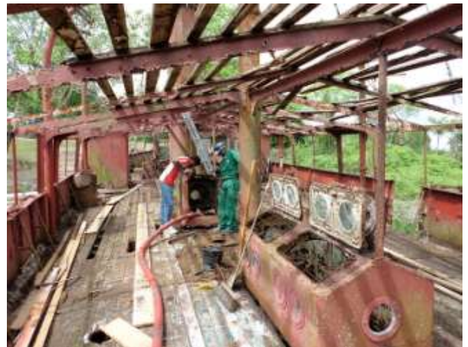
SURINAME -1, with restoration underway

Lichtschip Suriname River – 1 ARLHS SUR-004M