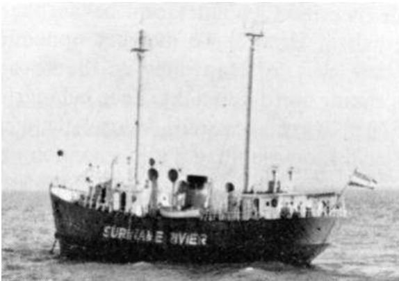
LV-106/WAL-528 as Lightship Suriname River 2 Photo source; date & photographer unknown

This makes the most sense to me and explains how the 109 wound up abandoned next to her sister ship the 106 on a Suriname River, riverbank!