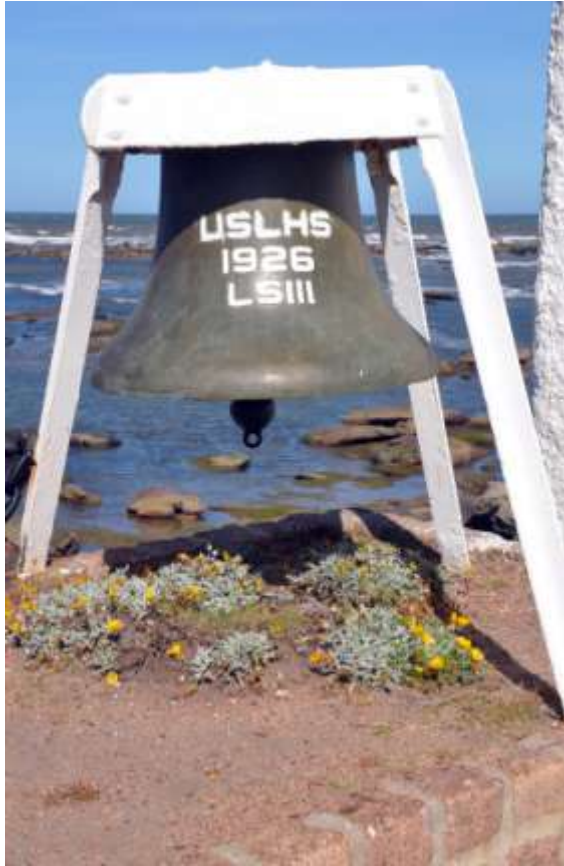
LS-111 Fog Signal Bell, which is on display at Faro (Lighthouse) Jose Ignacio near Montevideo.