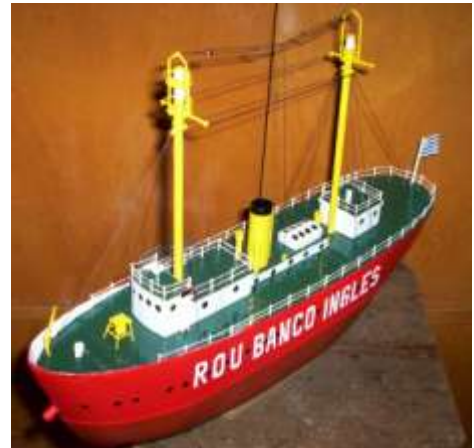
ROU BANCO INGLES Lightship Models

http://surinconnaval.blogspot.com/2010/12/buque-faro-rou-banco-ingles.html