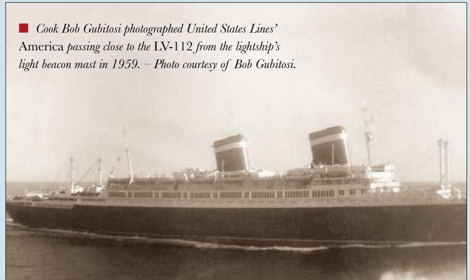
■ Cook Bob Gubitosi photographed United States Lines' America passing close to the LV-112 from the lightship's light beacon mast in 1959.

RAGING STORMS could last for days, with waves breaking over the bow. As the bow rose up from under its enormous weight, tons of water would wash down the deck and off the stern. Then the bow would be buried under the next wave, and the procedure would repeat itself over and over again. On the first day, everyone would continue to eat, and the cook would place a dampened tablecloth on the mess deck table to keep plates and food from sliding off. As the storm continued, fewer crewmen would be taking their meals; they would switch to apple and saltines. If the storm was violent