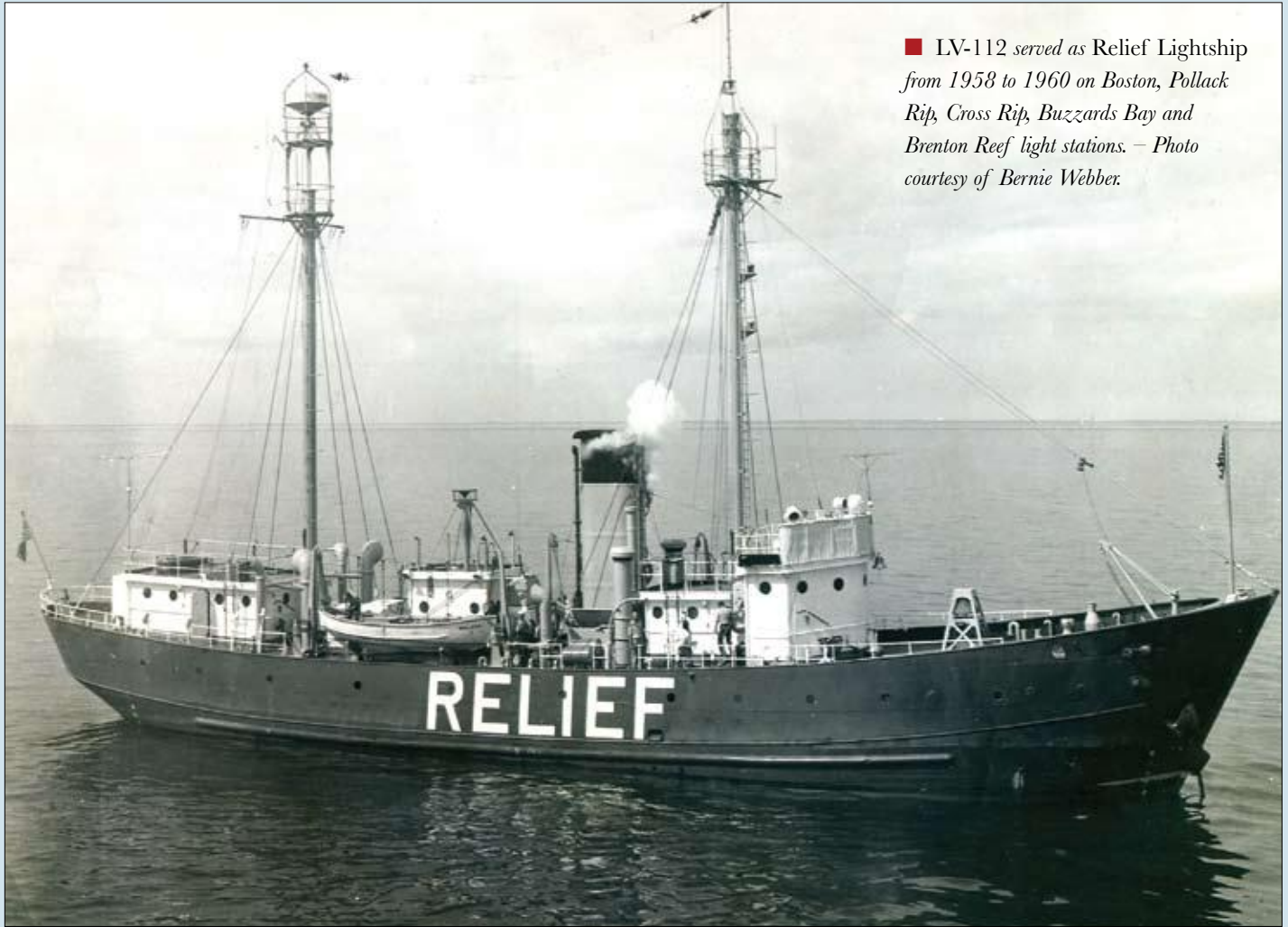
■ LV-112 served as Relief Lightship from 1958 to 1960 on Boston, Pollack Rip, Cross Rip, Buzzards Bay and Brenton Reef light stations.

“ THERE WERE MANY STORMS and hurricanes,” Gubitosi continued. “One scary night, we broke our anchor chain and did not know it. We wound up off the coast of New Jersey the next day with our radio beacon still going. I remember going on the bridge that night and watching the ship through the porthole, going up walls of water that looked like five- to ten-story buildings, then taking a nose dive straight down. The most pleasurable times were when the mail came, the few calm summer days without the fog horn, the fishing, watching the aurora borealis and the sea life.”