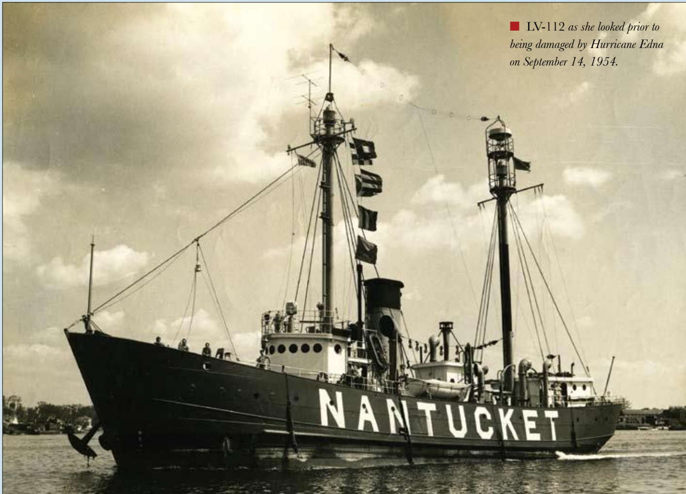
■ LV-112 as she looked prior to being damaged by Hurricane Edna on September 14, 1954.

movies, etc. Shark fishing was a favorite and risky activity. Blue sharks were common and plentiful. It was not uncommon to catch up to 15 sharks in one day that averaged six feet in length. They were usually thrown back in the water alive. During the Cold War days, it was fairly common to spot Russian trawlers nearby. In fact, Russian and LV-112 crewmembers occasionally had encounters and traded items such as cigarettes, fish, trinkets, and the like.